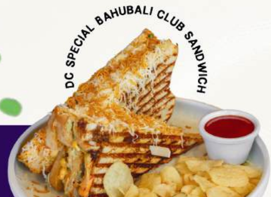
DC SPECIAL BAHUBALI CLUB SANDWICH

+ Make It a Meal $1.99 With Any Can With Milk Shake $4.99 ($1 Extra for Pistachio Milk Shake) With Fries $3.99 (in lieu of Chips) With Juice $4.50 ($1 Extra for Premium Juice)